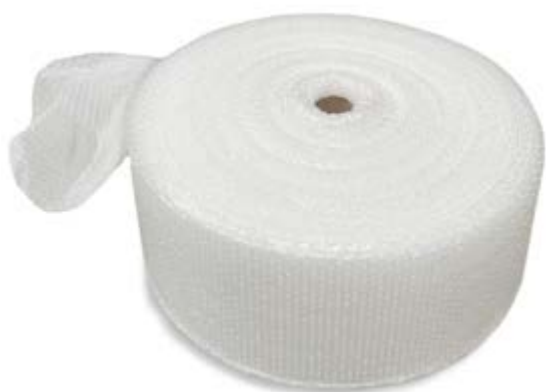
sleeve and half-sleeve